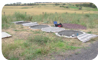
Figure 2. Treatment tanks at Toxic treatment Facility

The study reported contaminant removal performance for various filtration media including peat, perlite, peat/perlite blend, loamy soil and various amended media (Enviromedia). Only the data from the Enviromedia amended filtration media are reported here.