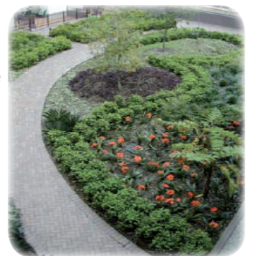
Photo of the courtyard where filtration and reuse occurs.

Of the 7,500 kilolitres of rain that falls on the site annually, 85% is captured and used. About 60% is used to flush toilets, the remainder to irrigate the gardens in the courtyards, while 25% passes through the gardens and is purified and stripped of most of the nutrients. The reuse scheme separates the dirtiest water from the Town Square pavement and treats it separately from the relatively clean water from the roofs. The water reuse within the development represents a saving in the order of 17% of mains water.